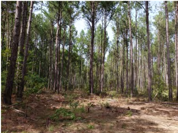
Sanders Tract West Photos